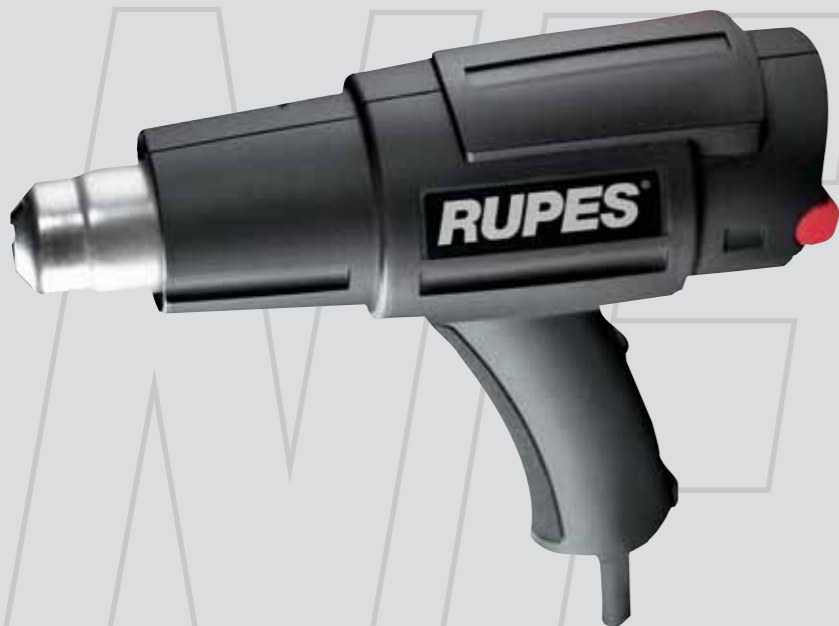
GTV16 Thermal guns