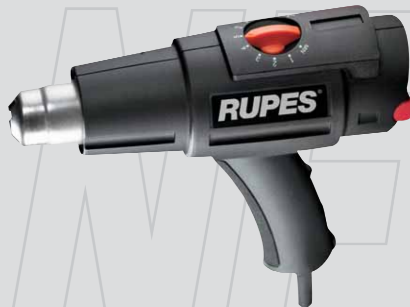
GTV18 Thermal guns